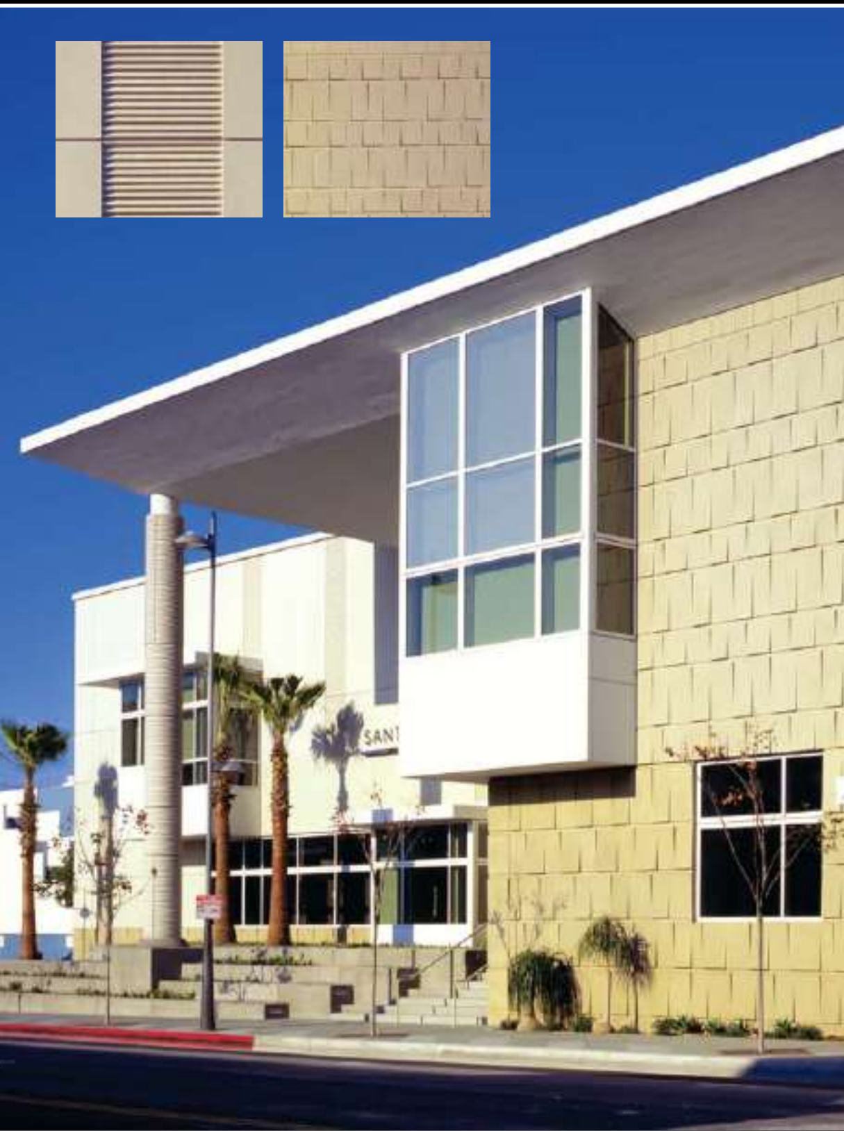
Santa Monica Public Library Santa Monica, California; Architect: Moore Ruble Yudell Architects & Planners