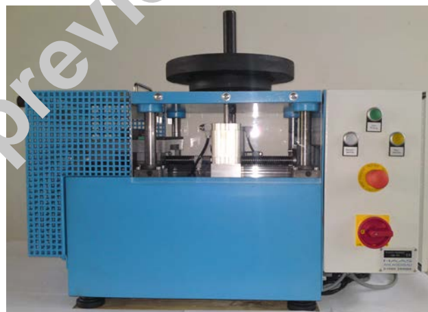
Figure 2: Example of a Gouge Tester