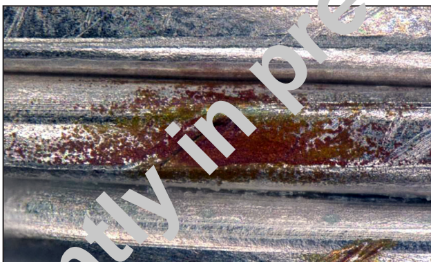
Figure 1-2 - Red Plague (Cuprous Oxide Corrosion)

1.5 Existing or Previously Approved Designs The implementation of a Red Plague Control Plan (RPCP) should not constitute the sole cause for the redesign of previously approved designs. When drawings for existing or previously approved designs undergo revision, they should be reviewed and changes made that allow for compliance with the requirements of the imposed Plan.