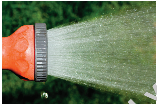
Figure 2. Garden hose.

The most common analogy is fluid flux, which is the time rate of flow of water, as shown in Figure 2 ;