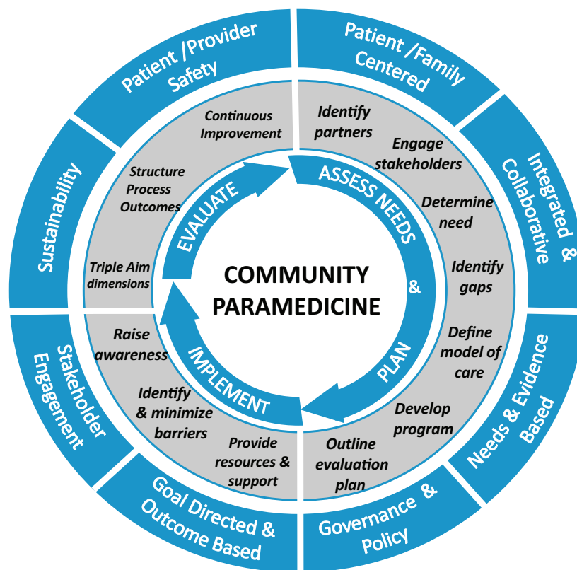
Figure 1 Framework for community paramedicine program development (See Clause 1.2.)