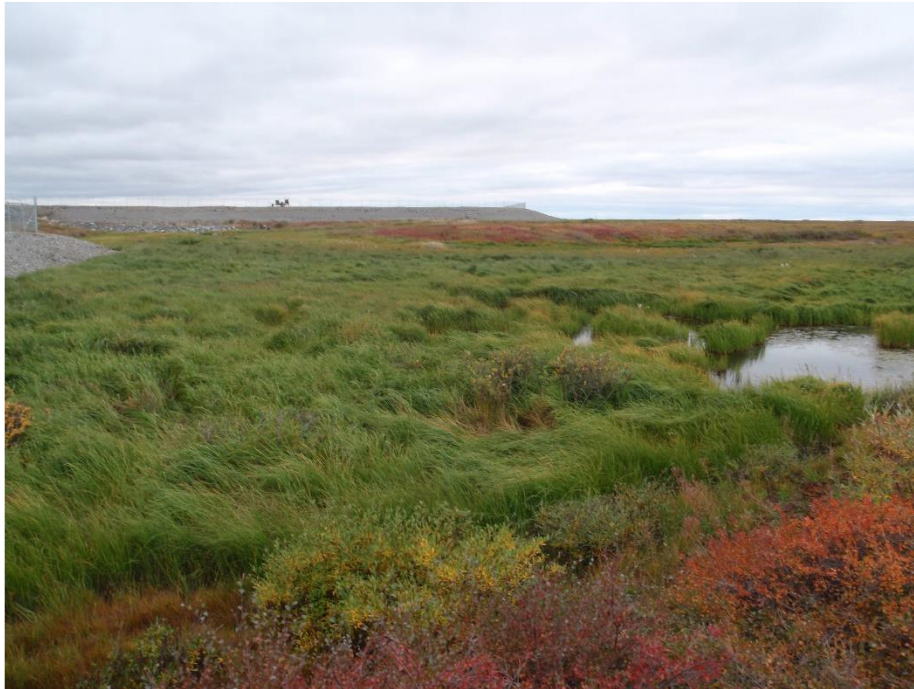
Figure 1 Wetland treatment area in Kugluktuk, Nunavut (See Clause 0.3.2. )

wetlands, by design, are more defined in terms of boundaries, hydraulics, and retention times. Therefore, treatment outcomes are more predictable and potentially more controllable than WTAs. Construction and operational costs, however, can be greater than WTAs due to the land requirements (footprint) needed to accommodate the larger flows generated during lagoon decants while maintaining adequate hydraulic retention times needed for adequate treatment. Figures 1 and 2 present examples of actual WTAs.