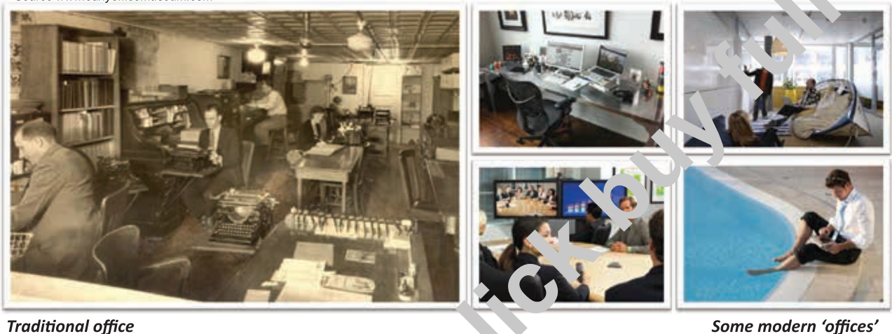
Figure 1 — Ideas of what constitutes an office are changing rapidly

The set of tools and equipment traditionally available to office users has also expanded and now includes on-line document creation and sharing, high quality colour displays, digital projection equipment, video communication and so on. Indeed there seems to be a new class of equipment, used to enable tasks traditionally associated with ‘the office’, introduced each year.