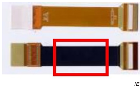
Figure 1 – Bare/shield FPCB

In recent years, since the use of smart phones, and other mobile and display devices has increased significantly, the supply of FPCBs has also been largely extended. Specifically, since the FPCB devices seek high speed performance, the requirements with respect to electromagnetic interference (EMI) suppression in the devices has also grown in importance. Therefore, FPCBs used inside smart phones employ noise suppression materials (NSMs) to solve EMI problems, as shown in Figure 1.