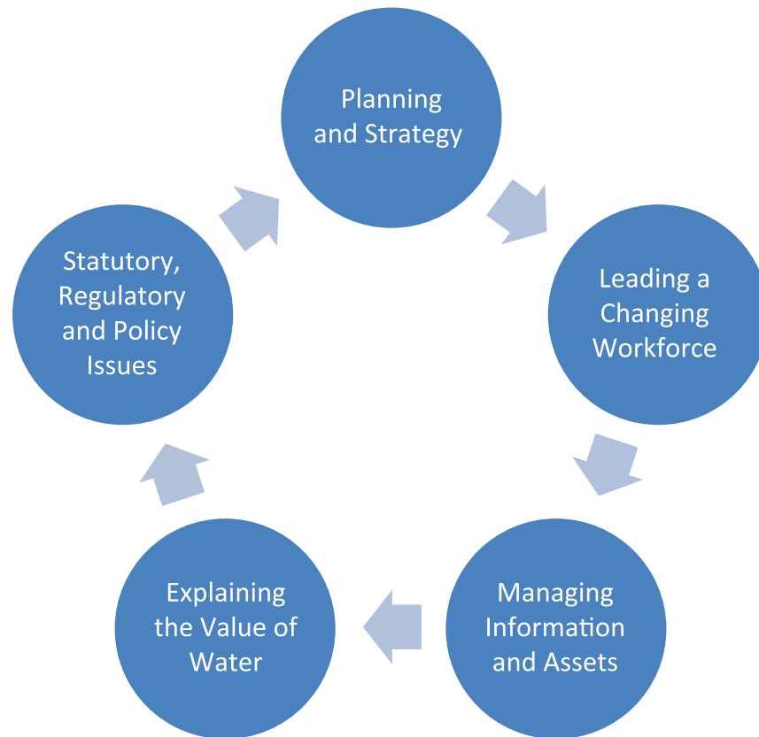
Figure 2-1 Strategic management of information

basics of how data flows throughout a utility organization. The second part details managing data across the many business processes found in a modern utility. The last part highlights some of the major trends in information management, including “Big Data,” cloud technology and security, mapping interfaces, social media, and business intelligence. The chapter concludes with a focused consideration of utility security issues anchored by a proactive approach.