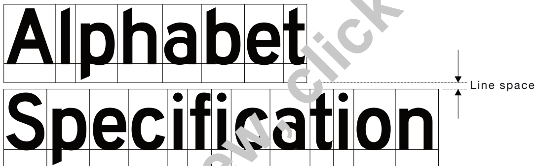
FIGURE 3 BOUNDING BOX AND LINE SPACE

Within each bounding box, each letter will have an amount of 'white space' to its left, right, top and bottom. This allows software to place bounding boxes side by side, top to bottom, or line by line without needing to worry about the shape and size of the letter or object (see Figure 3).