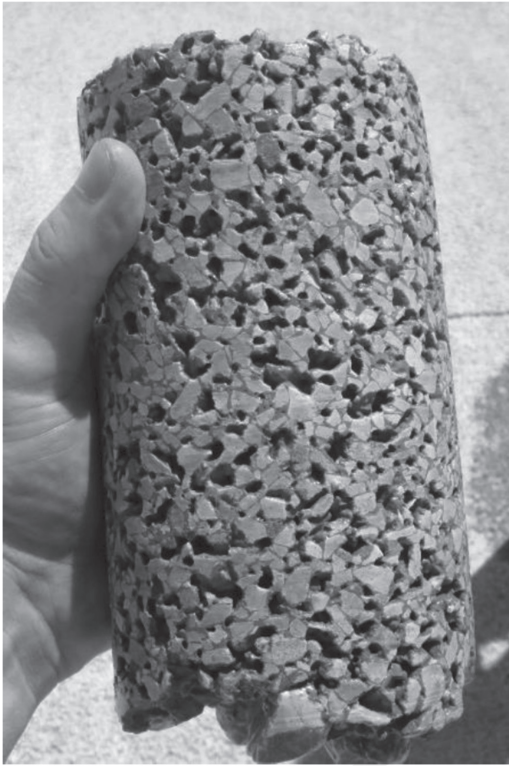
Fig 1.1b—Uniform porosity observed from a core sample.

ingredients will produce a hardened material with voids (Fig. 1.1b), ranging in size from 0.08 to 0.32 in. (2 to 8 mm), that allow water to flow through easily. The void content can range from 15 to 35%. The infiltration rate of pervious concrete pavement will vary with aggregate size and porosity of the mixture but will generally fall into the range of 250 to 1700 in./h (0.17 to 1.20 cm/s).