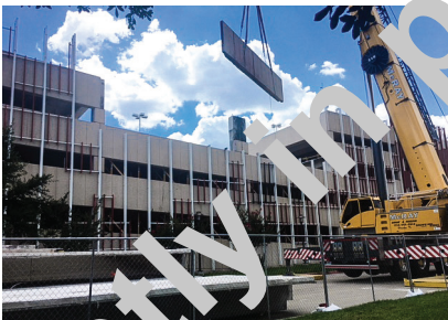
Fig. 7—Spandrel beam replacement

In addition to visual observations, a limited floor delamination survey was performed utilizing a chain dragging device to detect unsound concrete. An acoustical monitoring wheel and hammer sounding was used to detect delaminated concrete on the vertical and overhead elements.