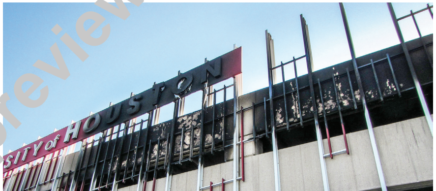
Fig. 3—Fire damage at exterior of garage