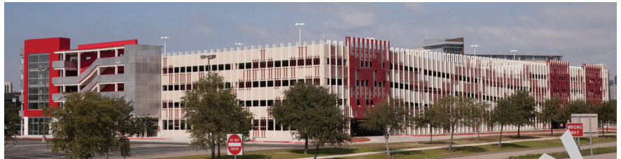
Fig. 1—University of Houston East Garage

Available background information and plans were reviewed, and a follow-up visual assessment of the damage was conducted on May 2, 2018. Prior to the second visual evaluation, the structural members within the fire-damaged area were cleaned using dry ice blasting that allowed a closer look at the extent of the damage.