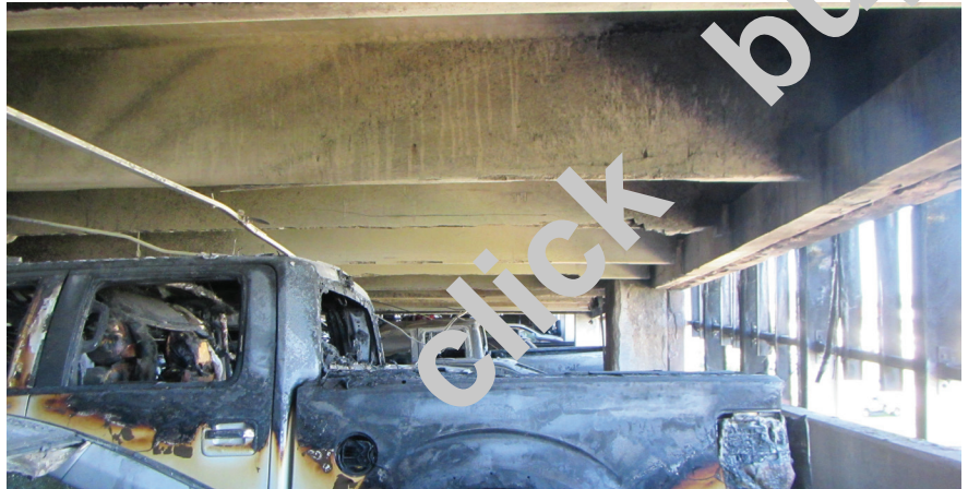
Fig. 2—Fire damage on Level 3 of parking garage