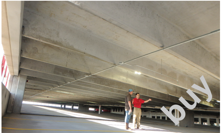
Fig. 8—New replacement double-tee beams at completion

The public garage proved to be a limited-space job site, leaving little room for repair materials and contractor use/laydown. While complexities were abundant, the project team worked efficiently to have the garage fully operational by the start of the fall semester. Ultimately, the team was able to come in under budget and ahead of schedule on repairs.