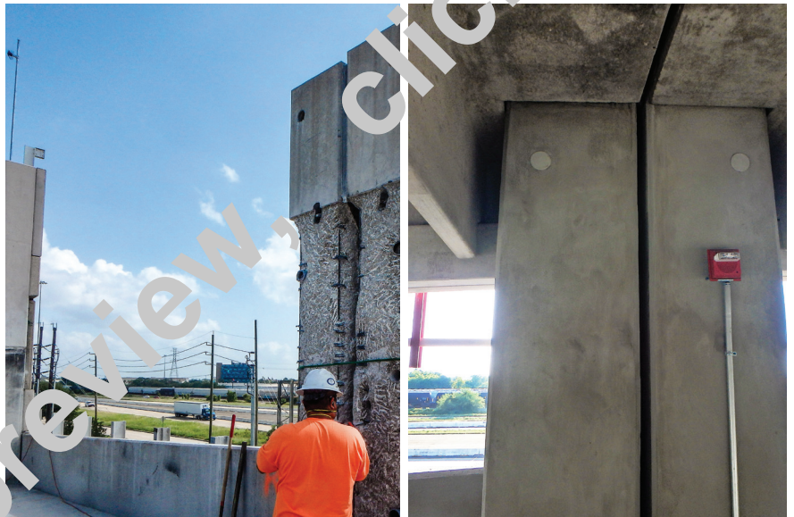
Fig. 9—Column during repair (left) and after repair (right)