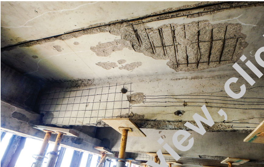
Fig. 6—Concrete cracking and spalling due to fire