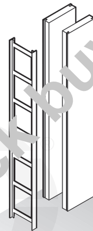
Fig. 1.1b—Vertical ladder and panel ICF system (ladder for interconnection).