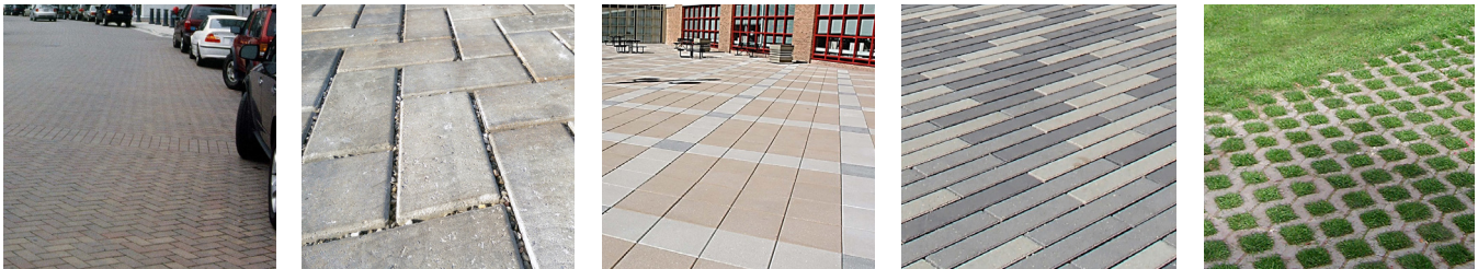
Figure 1-1. The Family of Segmental Concrete Paving systems (L to R): Interlocking, Permeable Interlocking, Paving Slabs, Planks, and Grids

The types of segmental concrete pavement systems include interlocking, permeable interlocking, paving slabs, planks, and grid units. These are illustrated in Figure 1-1 . This Guide provides technical information and references on the first two pavement systems as they are specifically intended for streets, making them of interest to state departments of transportation (DOTs) and municipal public works officials. Moreover, millions of square feet of permeable interlocking pavements have been placed in the United States and Canada.